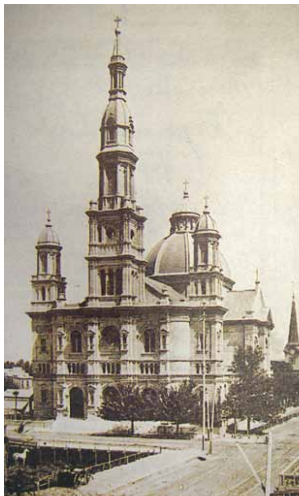
Cathedral of the Blessed Sacrament, 1899

Catholic elementary and high schools and more than 100 social service ministries. This rich history of faith and generosity of those who have gone before us created these many wonderful Catholic institutions with the common desire of sharing Catholic life and giving witness to our Catholic faith in the broader community. It is this same common desire which was the impetus for establishing The Catholic Foundation with the mission to “witness to Christ and His Gospel values of love, justice, forgiveness and service to all by ensuring the financial well-being of the Catholic works in our diocese.”